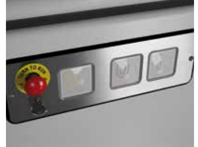
On-board control panel Silver