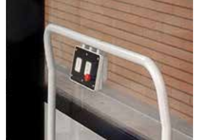
On-board control panel Steppy

the Steppy platform lift's technical and stylish features, make it a favourite among the best Italian installation engineers with hydraulic mechanics, metal or grey polycarbonate enclosure, to improve the design and the aesthetics of the lift. Vimec has designed a control on board and a landing radio control which makes the Steppy the functional leader in the market place.