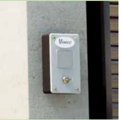
Floor control panel 50X50 mm - Silver