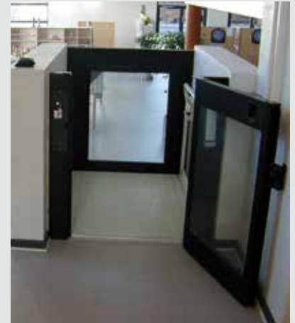
Steppy with automatic doors and gates