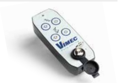
Floor remote control