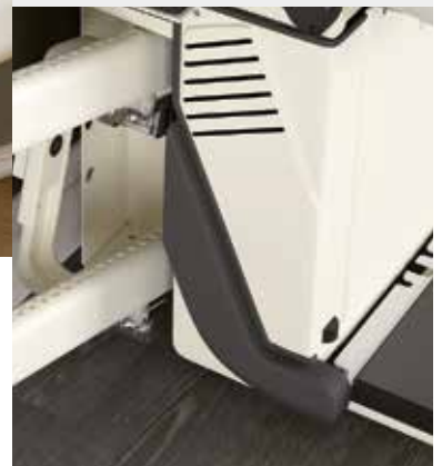
Footrest and machine body are equipped with sensors for complete security while using